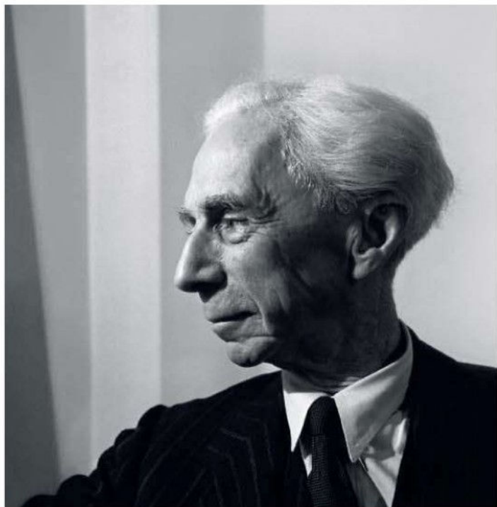
MADE IN THE UK

Known for her simple use of natural lighting and candid style, the classics on display at the NPG not only demonstrate why Bown is a master of her craft, but also that great pictures can be found in last-minute assignments, rushed interviews, poorly lit rooms and just about anywhere so long as you're open-minded enough to look for them. Jeff Meyer